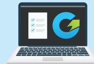
4. Local Machine + GenRocket Runtime