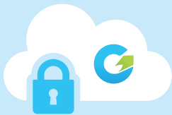
1. GenRocket Dedicated Private Cloud