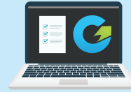
4. Local Machine + GenRocket Runtime