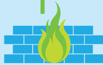
3. Your Corporate Firewall (HTTPS)